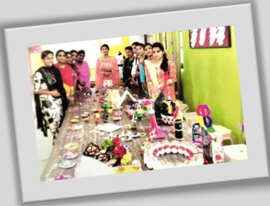
Dress Designing Dept. Exhibition