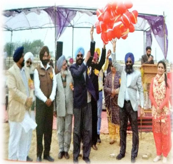
Athletic Meet Opening Ceremony