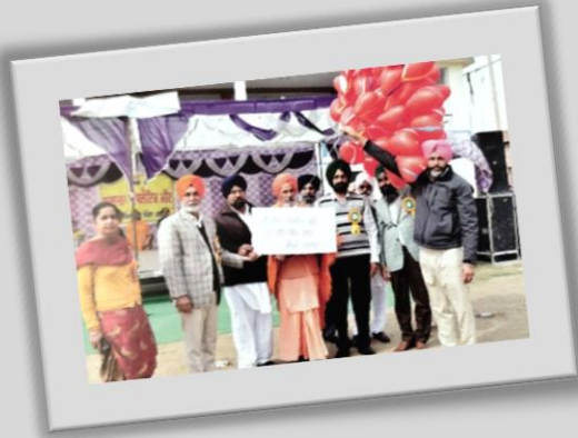
Athletic Meet Inauguration Ceremony