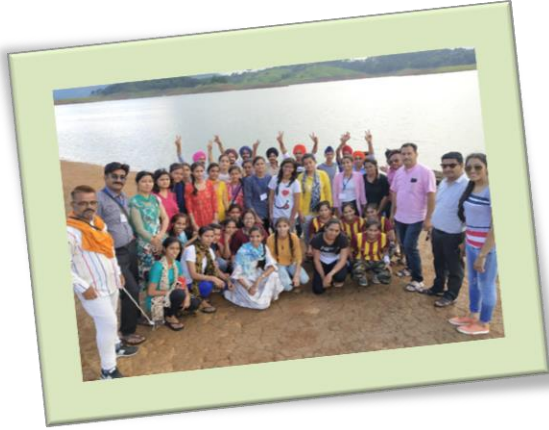
Physical Student's Tour