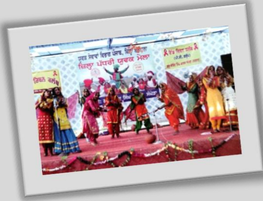
Giddha at District Level Youth Festival