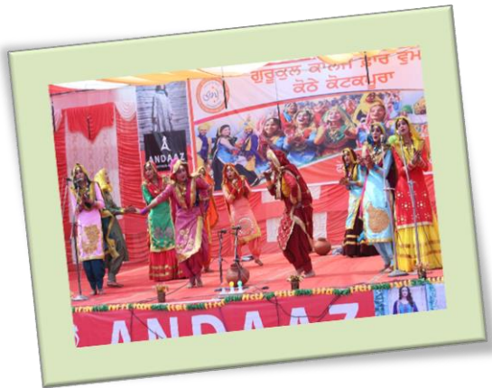
Giddha at Youth Festival