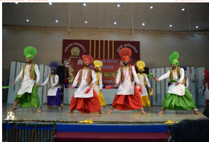
Bhangra Performance at Youth Festival