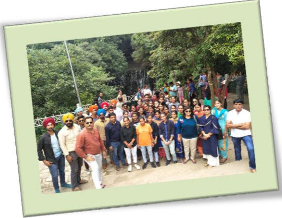
Physical Student's Tour