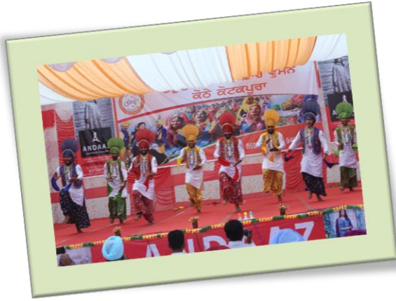
Bhangra at Youth Festival