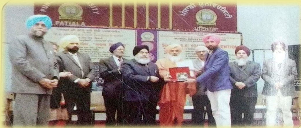
College Principal Receiving Best NSS Programme Officer Award

Our college has set an unbreakable record by winning numerous times.