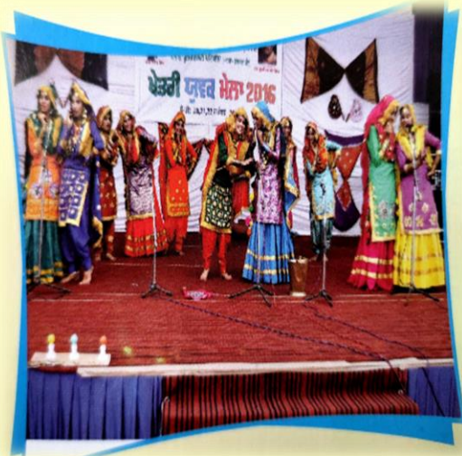
Giddha Performance During Youth Festival