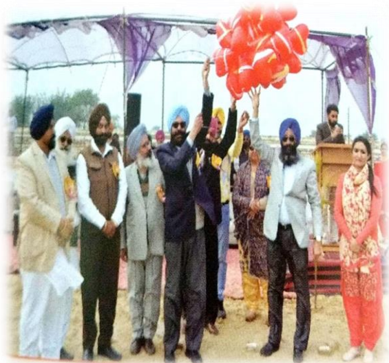
Athletic Meet Opening Ceremony