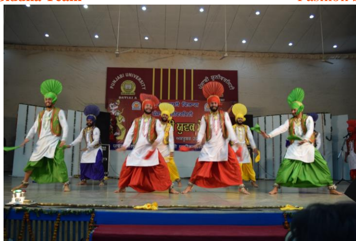
Bhangra Performance at Youth Festival