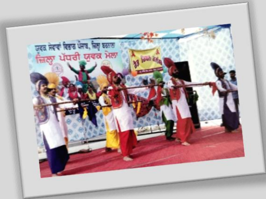
Bhangra at District Level Youth Festival