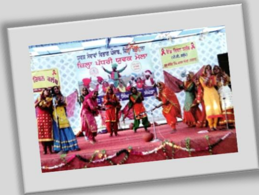
Giddha at District Level Youth Festival