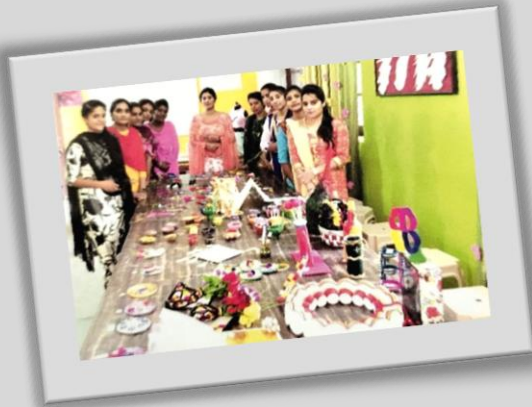
Dress Designing Dept. Exhibition