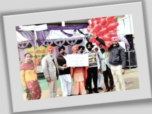
Athletic Meet Inauguration Ceremony